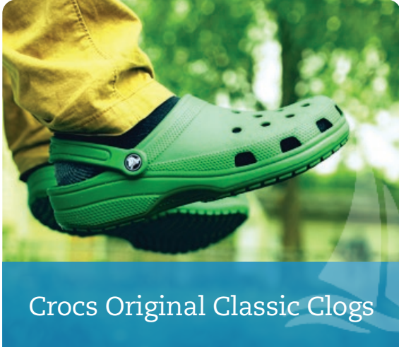
Crocs Original Classic Clogs